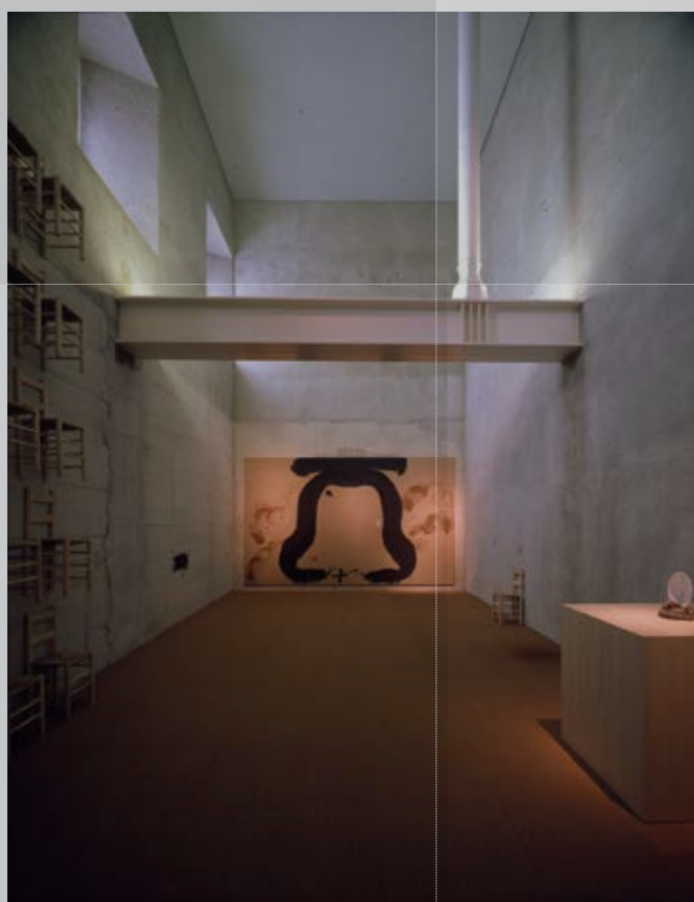
Antoni Tàpies, Reflection Room , 1996

* Universitat Pompeu Fabra. Edifici Jaume I. Carrer Ramon Trias Fargas, 25-27 - 08005 Barcelona. Opening visit: Friday October 7th at 7pm. The space is open and free for the public every Wednesday for the entire run of the 'Minus Ego' exhibition, from 7pm to 8pm.